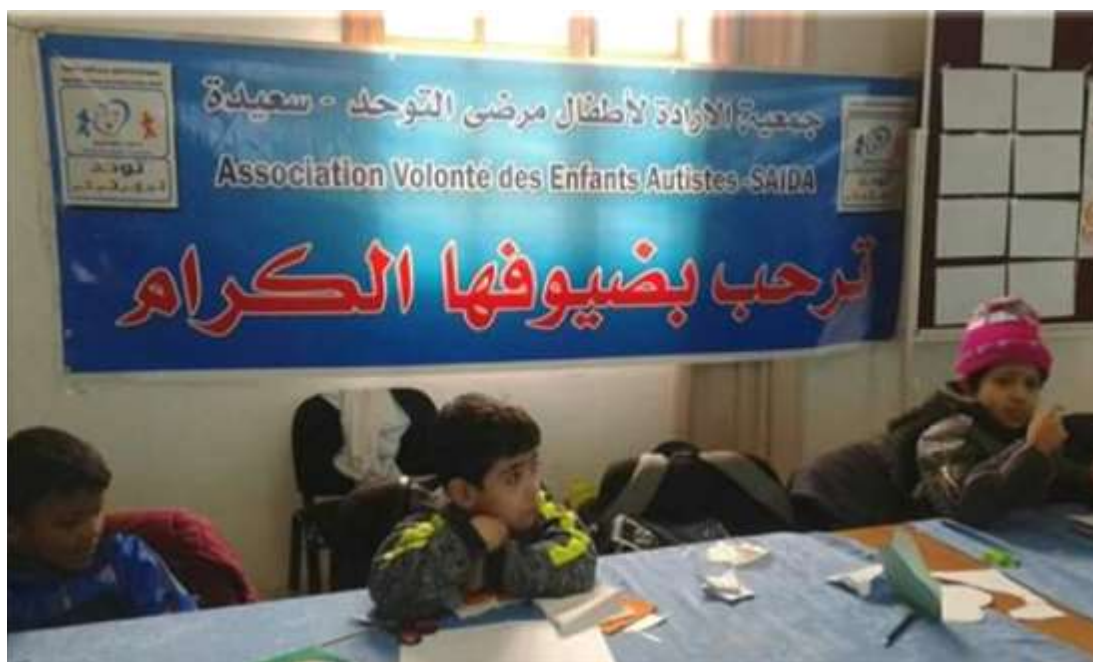
Figure 3. The Association of El Irada Litawaħud.

method to collect data because this method permits evaluators to study selected issues, cases, or events in-depth and detail; the fact that data collection is not constrained by pre-determined categories of analysis contributes to the depth and detail analysis of qualitative data. Additionally, a qualitative research method is widely used in healthcare research studies because it mainly targets the human experience they get, thus giving a better and deeper understanding of human morals which are complicated (Patton, 1987).