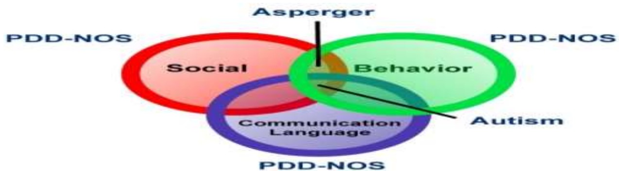
Figure 2. Types of autism.

in autism have been identified, including echolalia, pronoun reversal, metaphorical language, poor grammatical structure, atonality and arrhythmia. The followings are the main characteristics of language use and behaviors that are often found in children with ASD.