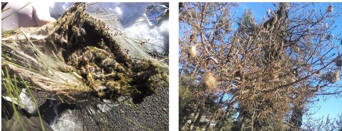
Figure 1. The nest (left) and foliage damage by pine processionary caterpillars (right).